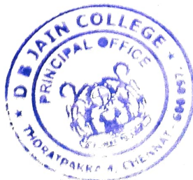
Principal & Chairperson - IQAC

Principal DHANRAJ BAID JAIN COLLEGE (Autonomous) Thoraipakkam, Chennai - 600097.