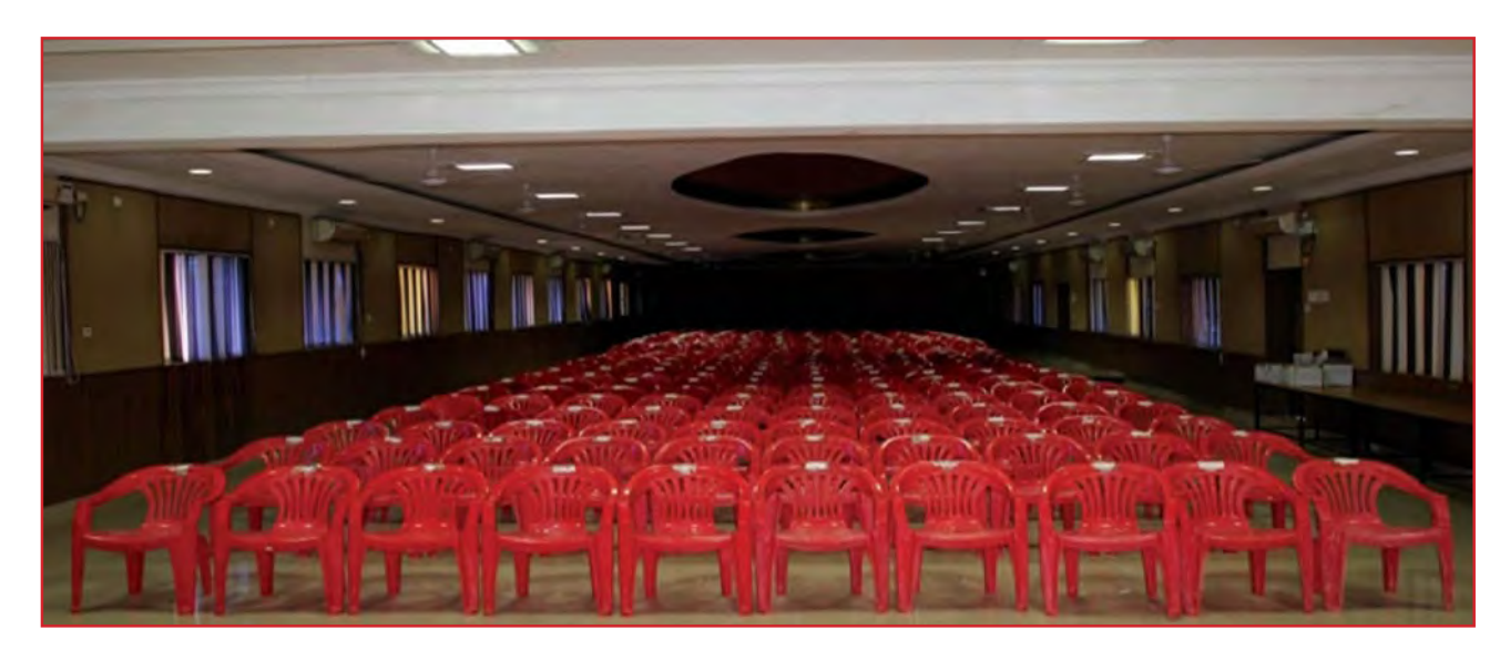
Sri Champalal Savansukha Auditorium has a seating capacity of 700. It is fully Air-conditioned and its light and sound system is currently being revamped. The Auditorium hosts various academic and cultural functions of the college.